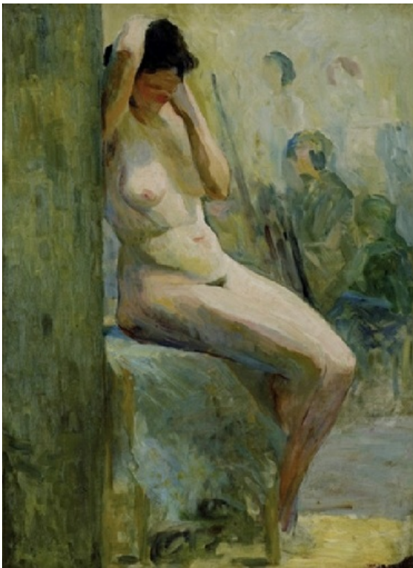
Tarsila do Amaral. Study of seated nude, 1921. Col Governo do Estado de São Paulo (made in Paris, when a student in Académie Julian).