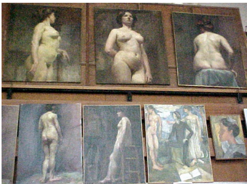
View of the Académie Julian collection. Atelier of Del Debbio, 2002. Before the transfer to National Archives.