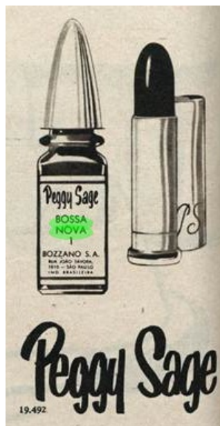
Bossa nova nail polish.