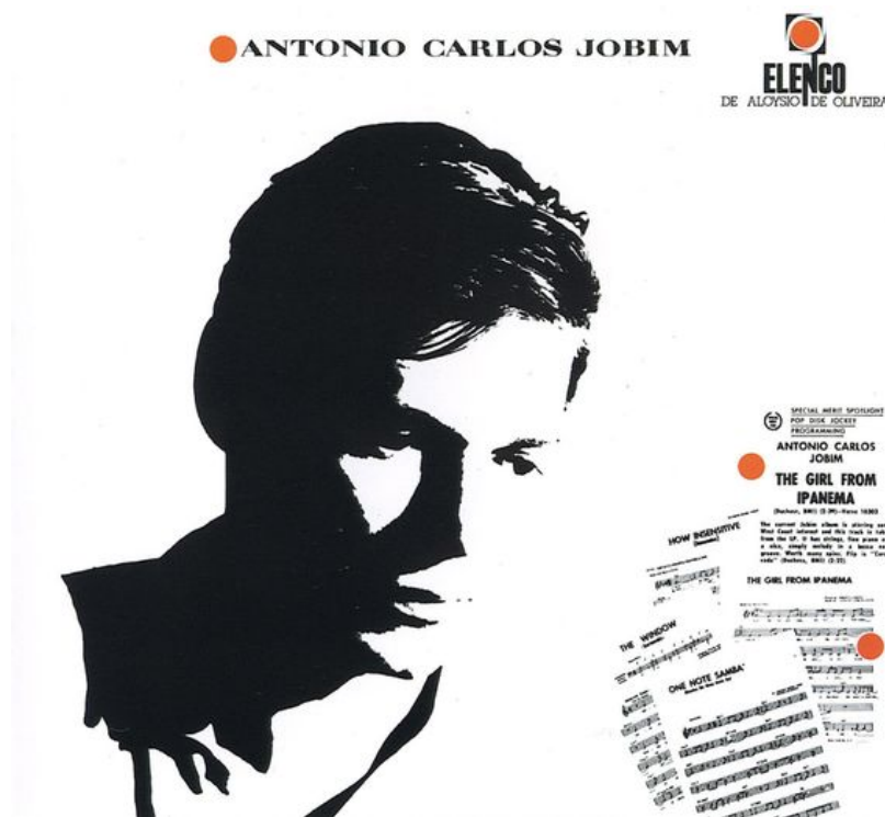
Cover of the Brazilian edition of Jobim's debut LP in the US.