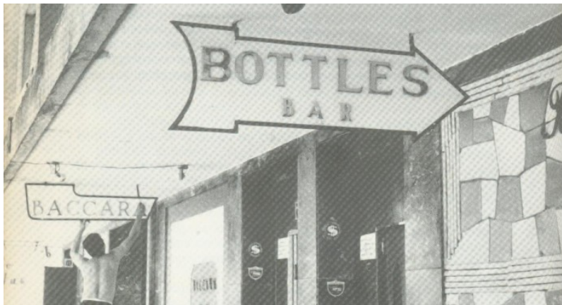
Beco das Garrafas (Rio de Janeiro)