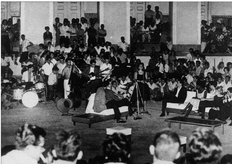
1st Samba Session Festival - School of Architecture, Universidade Federal do Rio de Janeiro, 22/09/1959