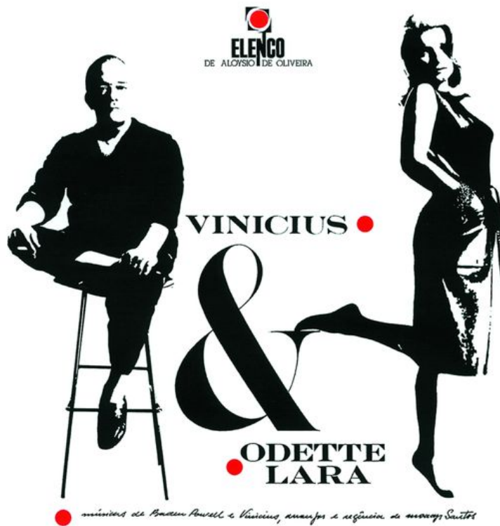
Cover of Elenco's debut LP: Vinícius de Moraes and Odette Lara.