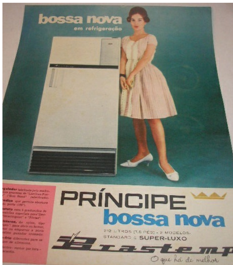
Brastemp "Príncipe Bossa Nova" Refrigerator.