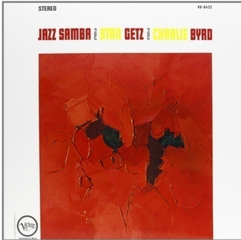
Cover of Jazz Samba (1962)

In its release of bossa nova albums, Verve Records sought to consolidate the prestige of the style, revealing special care in the preparation of covers, the inclusion of critical texts on the record sleeves, etc. The album covers: Jazz Samba , Big Band Bossa Nova , Jazz Samba Encore , Getz/Gilberto and Getz/Gilberto #2 , for example, had paintings by the Porto Rican painter Olga Albizu (1924-2005). Incorporated in the graphic project of the records was an abstract-expressionist style of an avant-garde nature which probably contributed to the aura of artistic exclusivity linked to the albums in the eyes of potential purchasers.