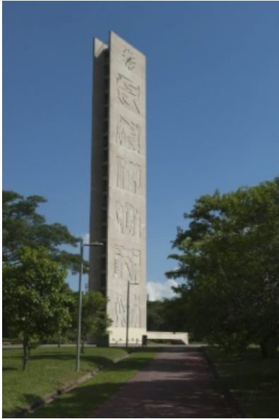
View of the Clock Tower on the Butantã campus of the University of São Paulo.

arranged in groups of six, represent the integration of the areas of Sciences, Arts and Humanities.