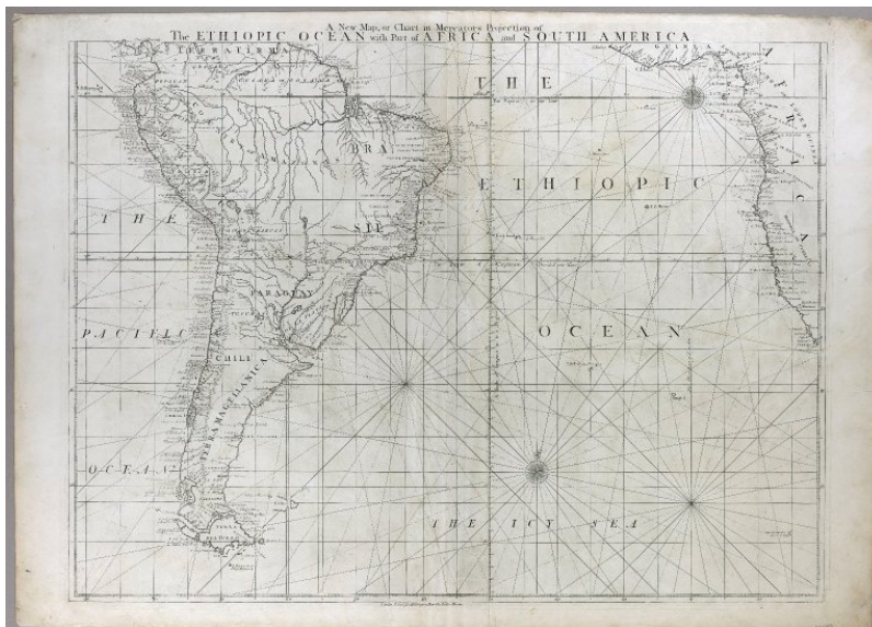
"Map of the Ethiopic Ocean including parts of South America and Africa", published in London between 1777 et 1780, John Carter Brown Map Collection, Brown University