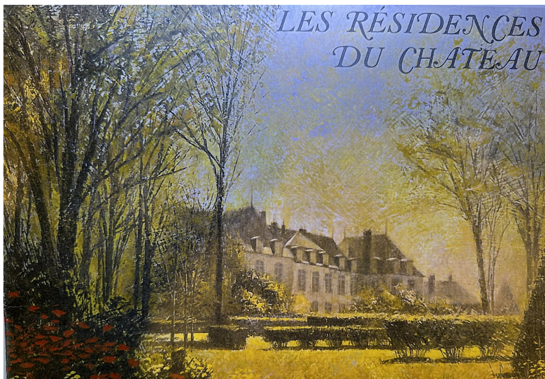
Résidences du Château Presentation Flyer

But despite the persistent preference for maisons individuelles, the dystopian view of American-style suburbia elaborated in the 1950s and 60s continues to shape elite attitudes in France, which still tend to neglect the problem of racial segregation. Take, for example, Fanny Taillandier's award-winning novel of 2016, Les États et empires du lotissement grand siècle. Archéologie d'une utopie . 26 The book begins with a short preface identifying William Jaird Levitt as the “merchant-builder [who] transplanted into Europe and France a North American model of town planning, that of the new village.” This was a housing ensemble built on “virgin land all at once” using “the principles of Fordism...adapted to Europe’s modest dimensions [relative to the US]... while maintaining its physical and symbolic affinity to America’s consumer society.” Taillandier named her fictional version of Le Mesnil-Saint-Denis “Grand Siècle” (the Seventeenth Century) because of its proximity to Versailles, the “new village” of Louis XIV and first full-fledged suburb of Paris.