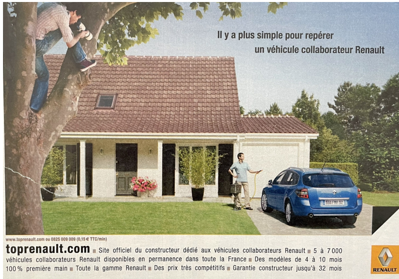
Levitt homes in Mesnil-Saint-Denis in French advertising

A more salient – and less dystopian – criticism, though virtually no one made it in the late 1960s and 1970s, would have been that the movement to single-family suburbs would only worsen France’s residential segregation by class and race. It was mostly white, middle-class families that relocated to the Levitt-inspired exurbs of major cities. Working class people either remained in suburban HLMs or took up residence in the Villes Nouvelles. 25 And as white people abandoned the grands ensembles, people of African origins progressively moved in. Government neglect set in, and the rest of the story is too well known to rehearse here. The new inhabitants of these HLMs, like most other French people, would have preferred single-family homes.