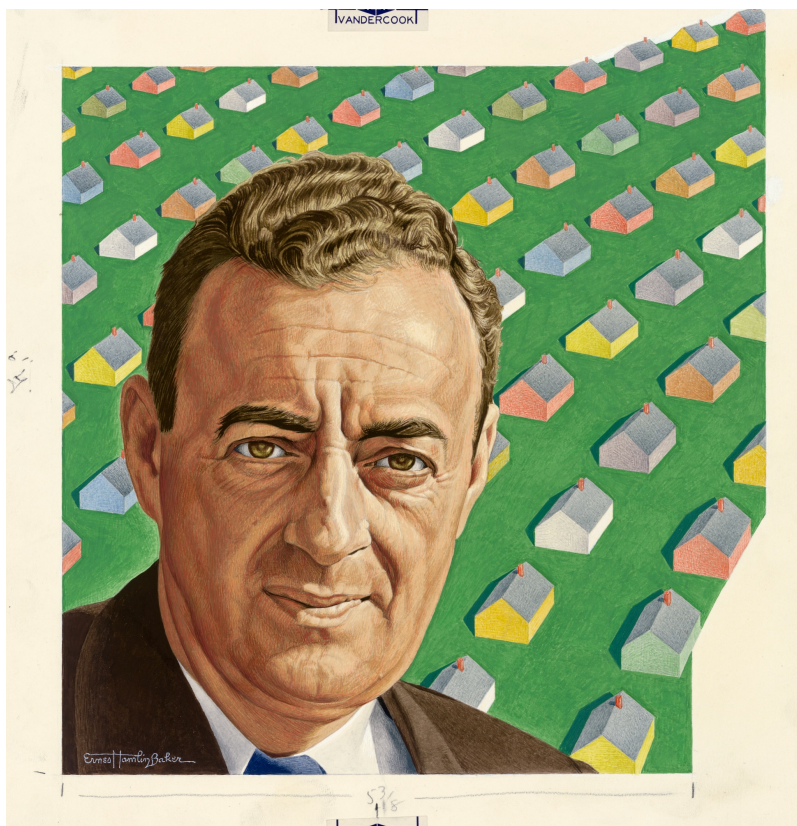
William J. Levitt, cover of the Time Magazine , July, 3, 1950

"France is in the same position today that Long Island was in fifty years ago" declared Bill Levitt at a Paris press conference in 1964. Levitt was the creator of several massive postwar American suburbs, "Levittowns" they were called, composed of identical or similar houses, built hundreds at a time using standardized components and an extreme division of labor. The American homebuilder found the French housing situation so backward that his company "can't afford not to go there." 1