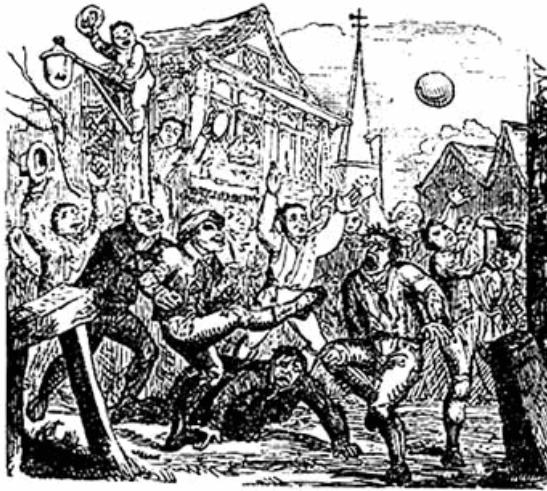
A folk or mob football game in London, 1721

favorable environment, each college developed its own version of folk football, depending in particular on the space available for playing it. Increasingly precise rules emerged (the first for rugby date from 1845). Universities and clubs sped the movement's momentum. Two main codes ultimately emerged: the "handling game" played in Rugby, where under certain conditions players were allowed to grab the ball by hand, and the «dribbling game," which was favored by other public schools, including Harrow. They became rival sets of rules; when clubs or schools met on the playing field, first they had to settle the issue of which ones to use. After many trials, soccer took a major step towards autonomy when the Football Association was created, followed in 1871 by the Rugby Football Union (RFU). This is when the conflict over whether or not the players should be paid erupted, which led to two different results. While soccer averted an internal crisis by becoming professional, rugby's governing bodies chose to keep the sport an amateur endeavor. The decision was opposed by some clubs in northern England, which split off from the RFU by creating the Northern Rugby Union (1895), giving rise to a new professional sport, 13-a-side rugby (rugby league). The southern clubs remained loyal to amateur rugby; 15-a-side rugby did not become officially professional until 1995.