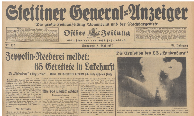
Front page Hindenburg photo in the Stettiner General-Anzeiger , May 8, 1937

Chermette has shown in the case of the French press, early resistance to wire photography gradually broke down, and by the 1930s the large circulation French dailies were well supplied with wire photos by the Paris branches of the American photo agencies.