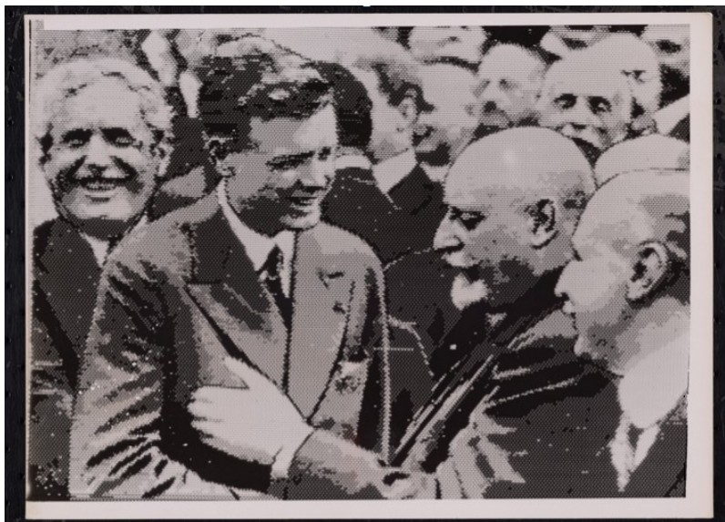
Lindbergh meeting French aviator, inventor, and engineer Louis Blériot, who

Wire photography operated on the tantalizing edge of what was seeable, as a degraded copy that traded quality for speed. Yet rather than a bug, the wire photo's visual impoverishment could be a feature. Precisely because this "first impression" was hazy and indistinct, it simultaneously made something else visible: the infrastructural effort that undergirded photojournalism and was reshaping spatial relations around the Atlantic basin. When Charles Lindbergh made his transatlantic flight in 1927, the news photo agency "Pacific and Atlantic Photos" transmitted this picture of his arrival in Paris back to New York by cable. The picture is visually "poor," with most of the finer gray tones having fallen out due to the transmission process. Its lack of visual detail was evidence of its infrastructural path beneath the waves. This formal quality set up a productive interplay between the picture's denotative content—the pilot who has bridged space—and connotations of transatlantic connectivity. As metaphor, the pilot visualized how wire photography used telecommunications infrastructure to stitch, bind, and link distant places into a simultaneously unfolding visible present. Infrastructure's typical mode is to withdraw from view, and it is frequently concealed by design. However, in middle decades of the twentieth century wire photos tended to visually register traces of their bumpy transatlantic paths through electrical circuits and adverse weather patterns.