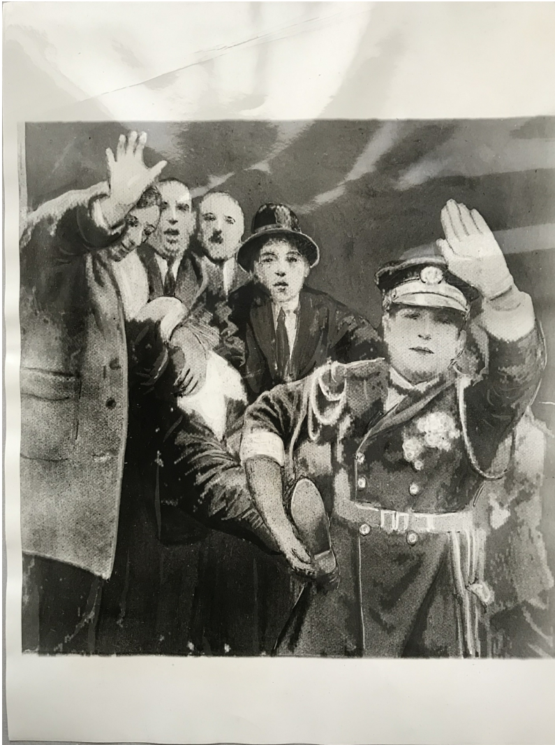
Associated Press photo depicting the immediate aftermath of President Paul Doumer's assassination in 1932. The picture was likely flown by plane from Paris to London, and then transmitted by cable to New York, using the Bartlane method. The verso (below) informs picture editors, perhaps unnecessarily, that, "this picture has been slightly retouched."

However, efforts to associate wire photography with mechanical or indexical visual documentation were troubled by the fact that, until certain technical challenges were overcome, the transmission process degraded the edges and tones of the photographic image. Newsroom artists often had to step in to retouch the image with pen, ink and brush in order to salvage visual information distorted in transmission, often to the extent that their autographic reworking was clearly visible in the halftone reproduced in the newspaper. The wired image therefore extends much further into the twentieth century the long process of adjustment and hybridization in which the press deployed techniques from drawing and engraving as well as photomechanical processes to illustrate the news. Wire photography was not merely a way to create a transparent window onto distant events. Instead, it made visible in various ways the infrastructural, technological, and organizational effort to picture world events in a new temporal horizon.