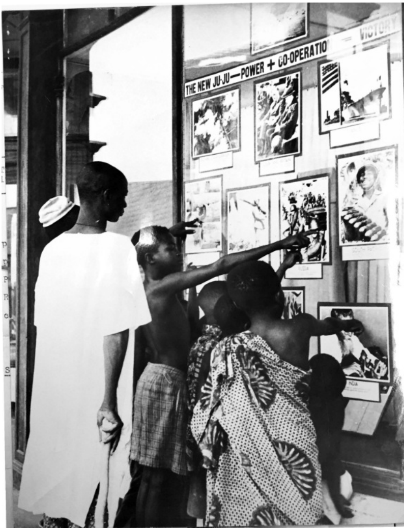
From OWI Radiophoto Unit File-Brazzaville. The Label on the top of the photo display board reads "The New Ju-Ju—Power + Cooperation = Victory." The OWI's caption pasted to the verso reads, "Somewhere in Central Africa, June 14, 1943: Clustered about OWI picture exhibit showing the new Juju, or "witch doctor magic" of the Allies, African natives look at photographs of United Nations' activity in the war for freedom.

Source : Records of the Office of War Information, Record Group 208; National Archives at College Park, College Park, MD