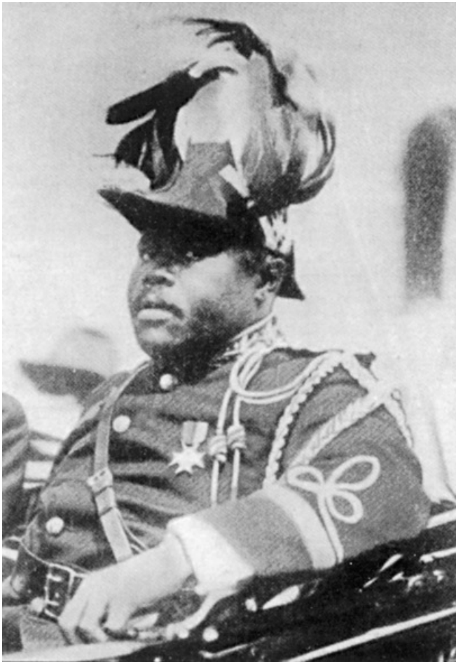
Marcus Garvey in 1920