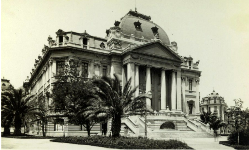
La Escuela de Bellas Artes, de Santiago du Chili, photograph, ca. 1910