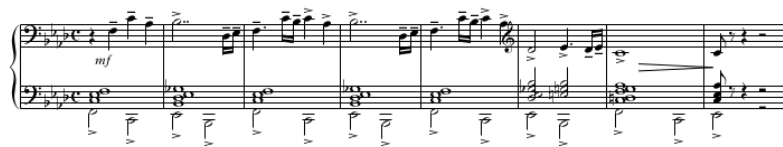
Miklós Rózsa, opening theme from Double Indemnity (1944). Personal transcription

The perpetuation of the tonal idiom, writing, and orchestration inherited from the 19th century is often emphasized as a marker of the Classic Hollywood Film Score. The harmonic language, however, is often rich, going well beyond the scope of German post-romanticism. It integrates the traditions of Brahms, Wagner, Mahler and Strauss, as well as the innovations of Tchaikovsky, Rachmaninov, Stravinsky, Ravel, Debussy and Bartok. Hollywood scores often place static harmonies against parallelisms, creating an ambiguity between tonality and modality. Simple chords, which are anchored in either a tonal idiom or an identifiable pole, are coupled with complex chords with frequent added notes—seventh, ninth or even eleventh—which blurs tonality, as in the opening theme for Double Indemnity (1944), written by the composer of Hungarian origin Miklós Rózsa.