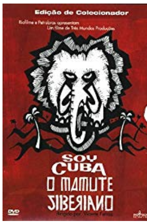
Cover DVD Soy Cuba - O Mamute Siberiano