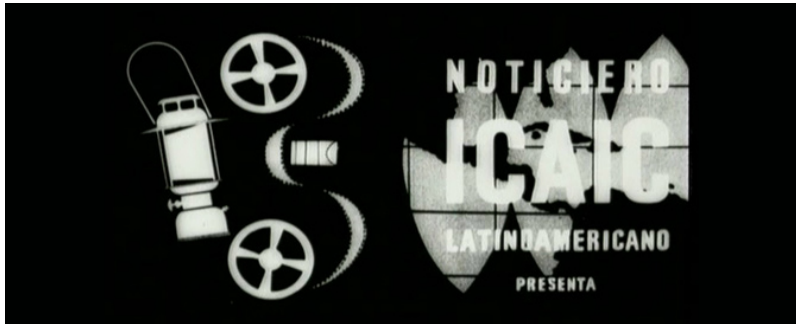
O Noticiero ICAIC Latinoamericano