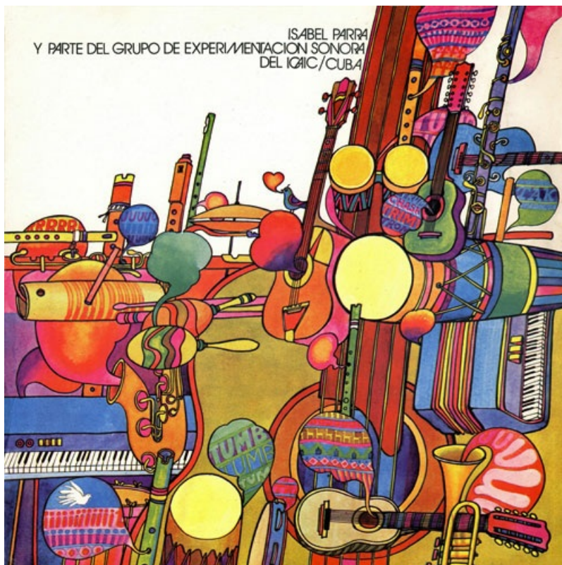
I P recorded in Cuba and Santiago de Chile between 1971 and 1972 Released