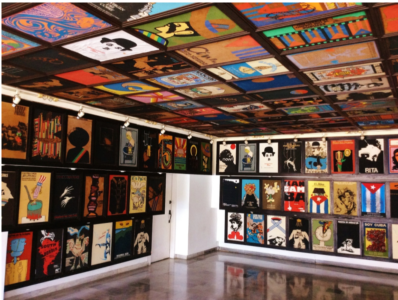
Entrance hall to the principal ICAIC building, covered in film posters made in ICAIC (by Cubans and foreigners) or exhibited in Cuba, principally in the 1960s and 1980s.