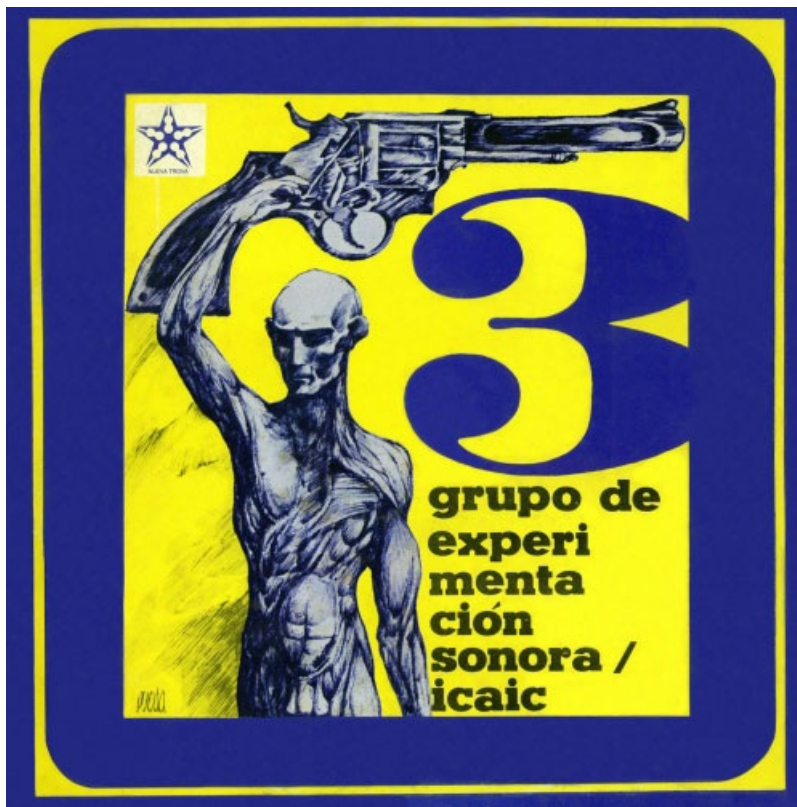
Covers of the LPs "G.E.S./Icaic 3"