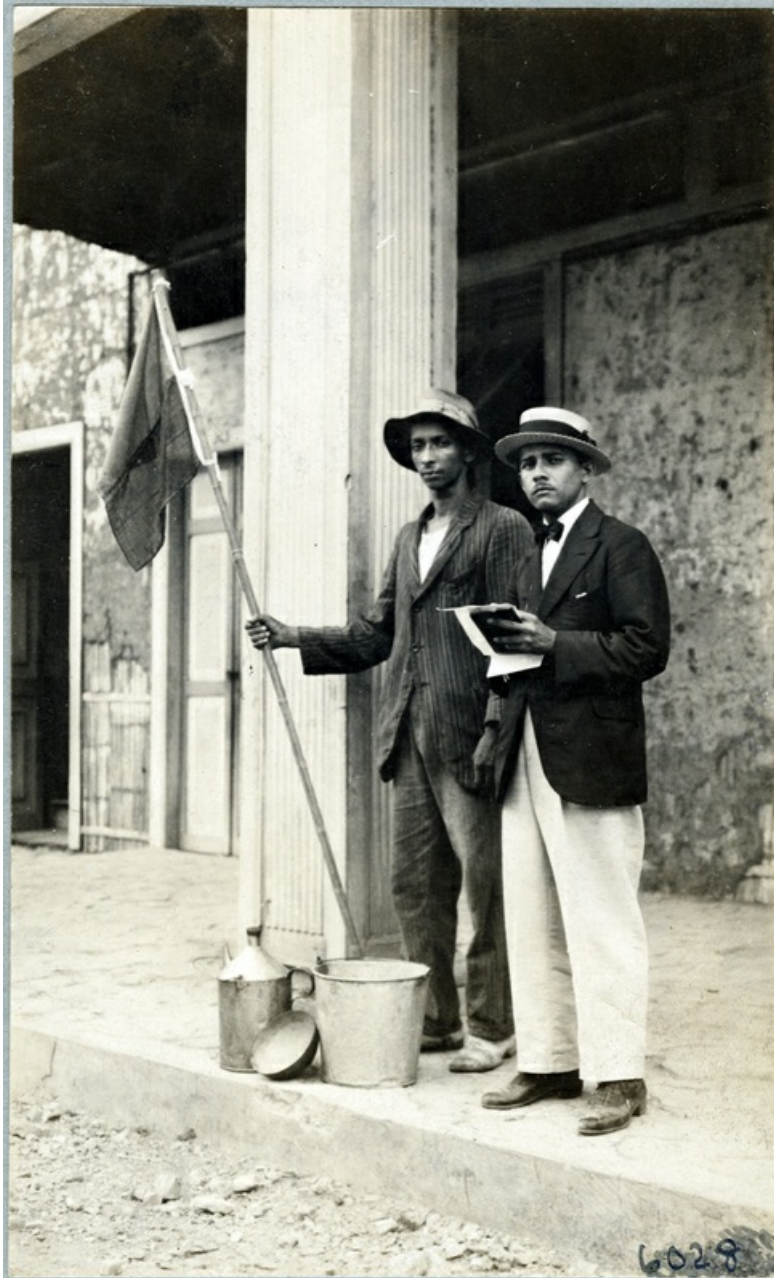
“Sanitary squad with full equipment, Yellow Fever control”, Guayaquil (Ecuador), 1918 (Rockefeller Archive Center, Rockefeller Foundation records, photographs, box 84, folder 1699).

At first, the Rockefeller Foundation focused on public health issues, especially in Latin America, where in 1916 it conducted surveys in many countries, followed by programs to eradicate diseases such as hookworm, malaria and yellow fever. The largest of these took place in Brazil (1923-1940), Argentina (1920-1929), Colombia (1920-1929) and Venezuela (1927-1928).