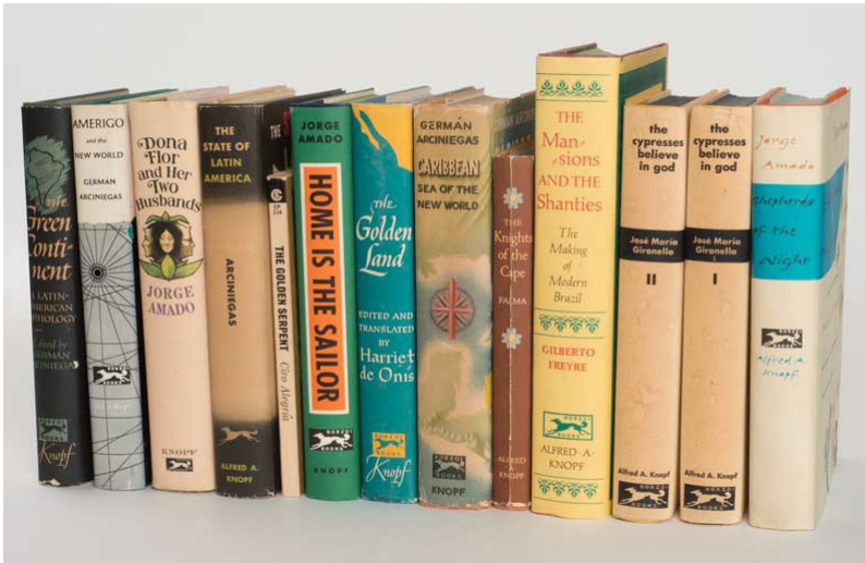
Latin American literature published by Knopf