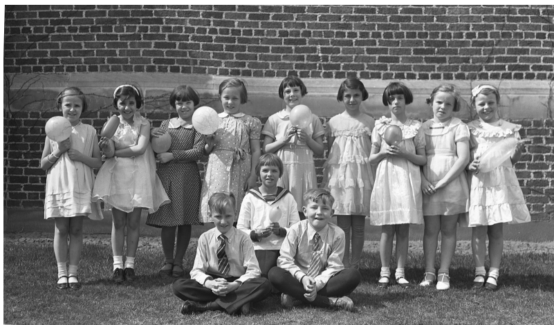
Pupils from Ontario School for the Deaf (now the Sir James Whitney School for the Deaf) in Belleville, Ontario, between 1936 and 1939

This section endeavors to bring to light the diversity of elements encapsulated by the term "education" in a transatlantic perspective. The articles touch on educational policies and institutions, currents and movements whose focus is education, pedagogical science and the content of teaching, as well as the material framework of delivery. The picture would not be complete without paying attention to the agents: teachers, pedagogues, targeted audiences, national and international bureaucrats, experts, etc.