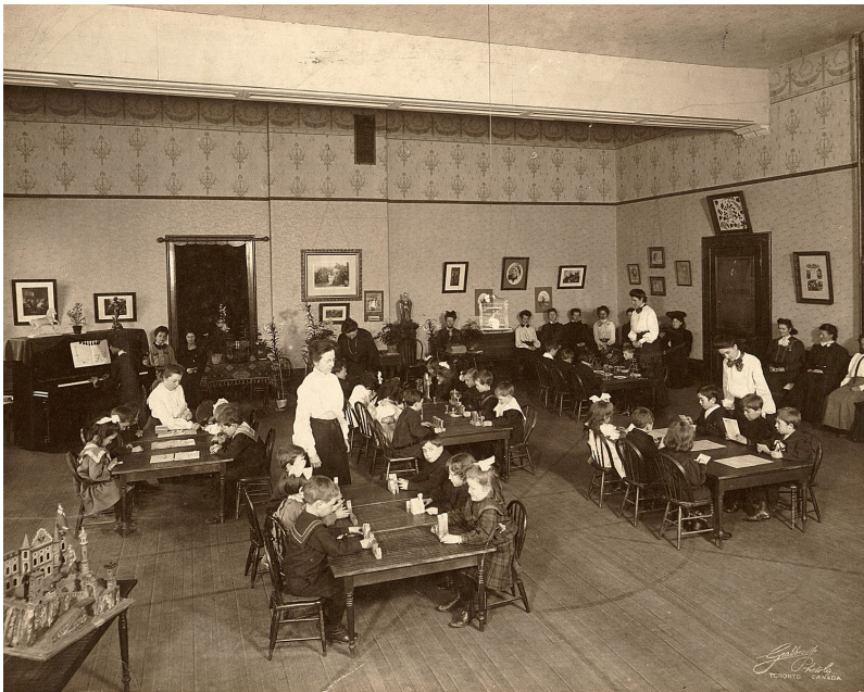
Student teachers practice teaching kindergarten at the Toronto Normal School, Canada (c. 1898)

Moreover, it is important to be attentive to the dynamics of resistance, as well as redefinitions, and hybridizations that these circulations produce in the field of education—all of which presupposes the interlocking of local, national, regional and international frames of reference.