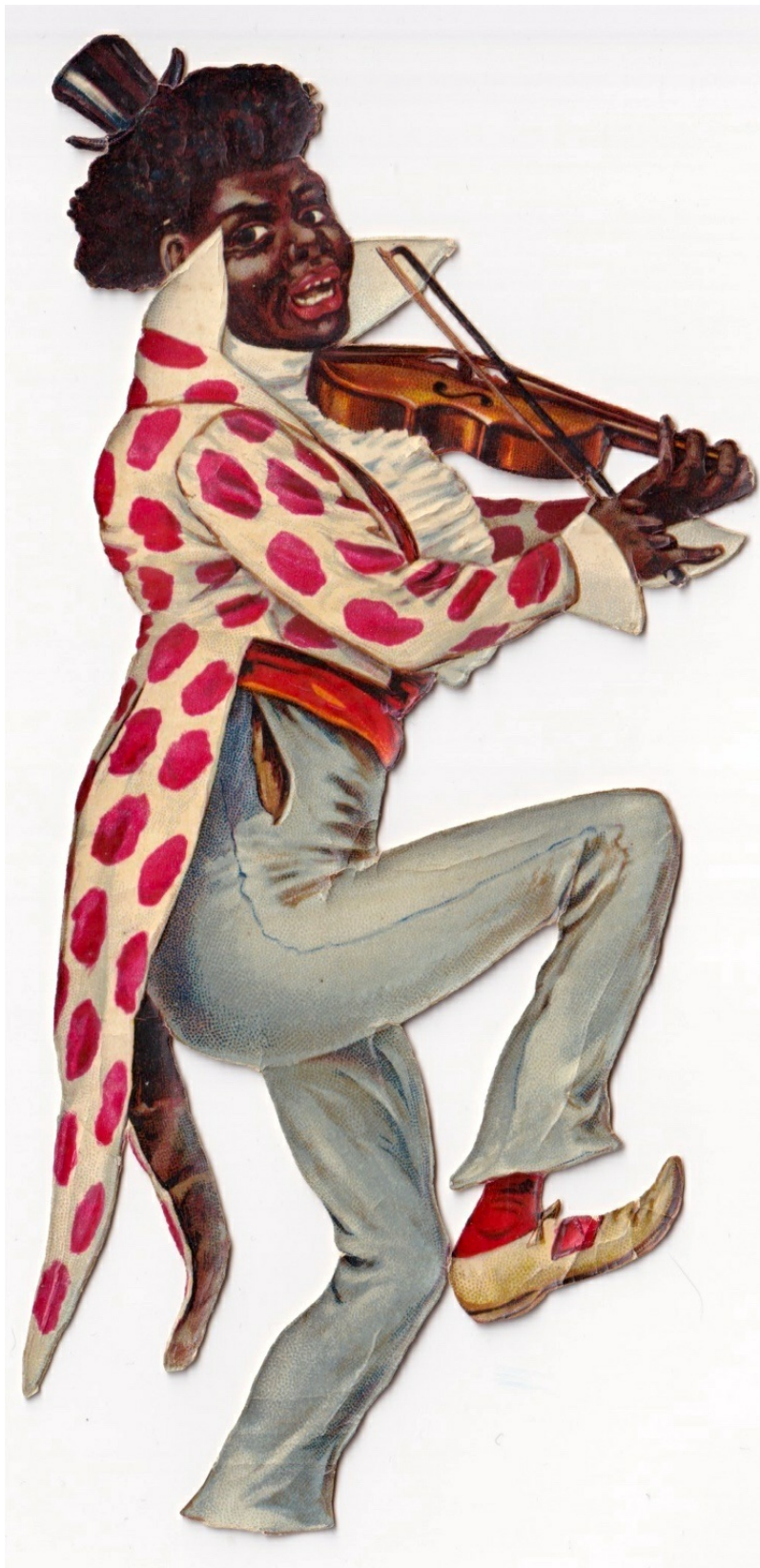
Minstrel , Chromolithography, circa 1910