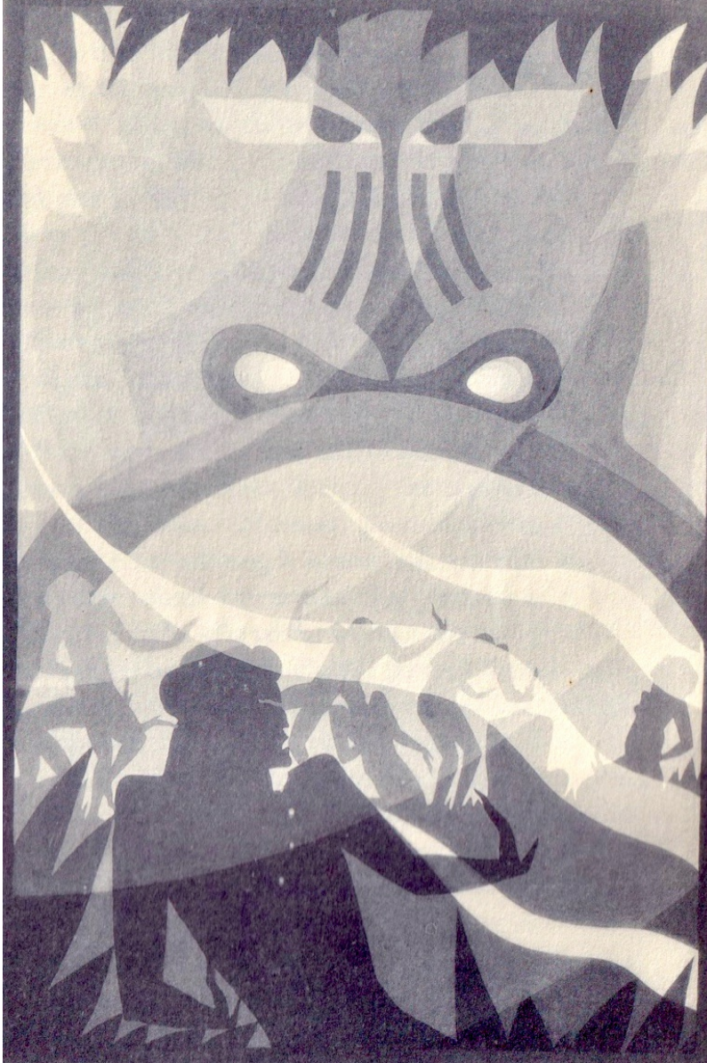
Aaron Douglas, illustration for the English edition of Black Magic by Paul Morand, 1930