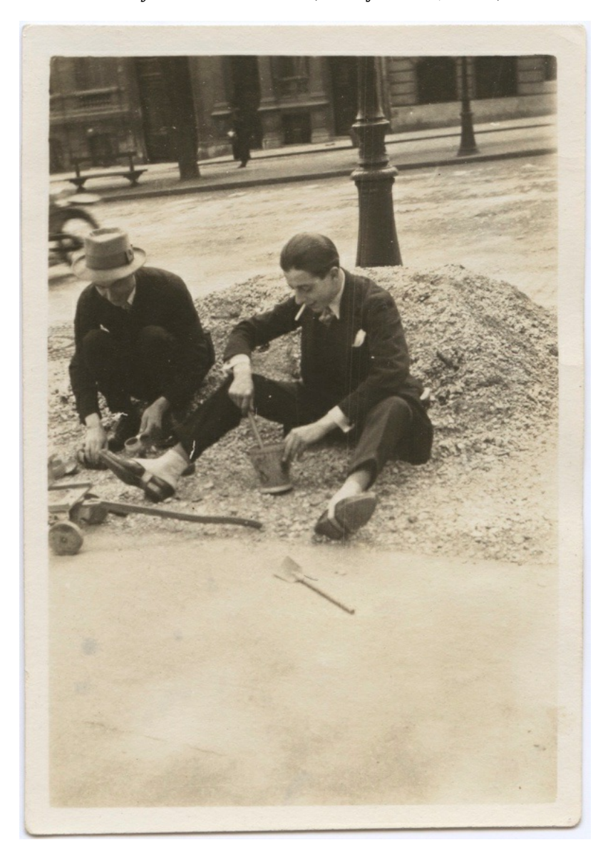
Yves Tanguy and Jacques Prévert in 1925

Fuente : Fatty à la fête foraine (Coney Island, 1917)