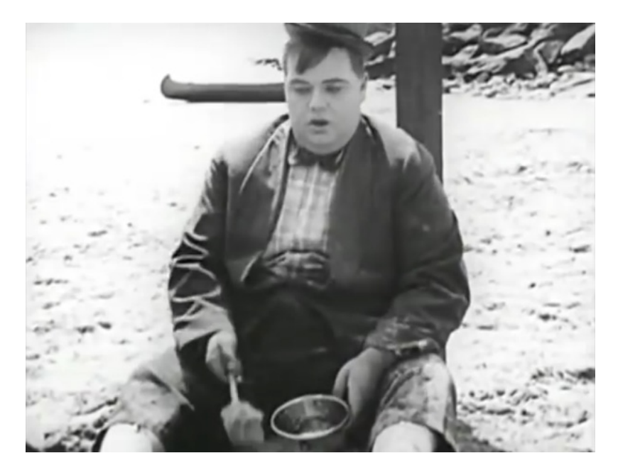
Fatty with his bucket and pail

Fuente : Fatty à la fête foraine (Coney Island, 1917)