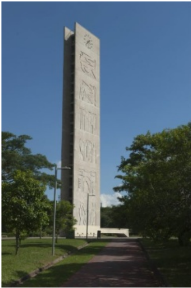
View of the Clock Tower on the Butantã campus of the University of São Paulo.

arranged in groups of six, represent the integration of the areas of Sciences, Arts and Humanities.