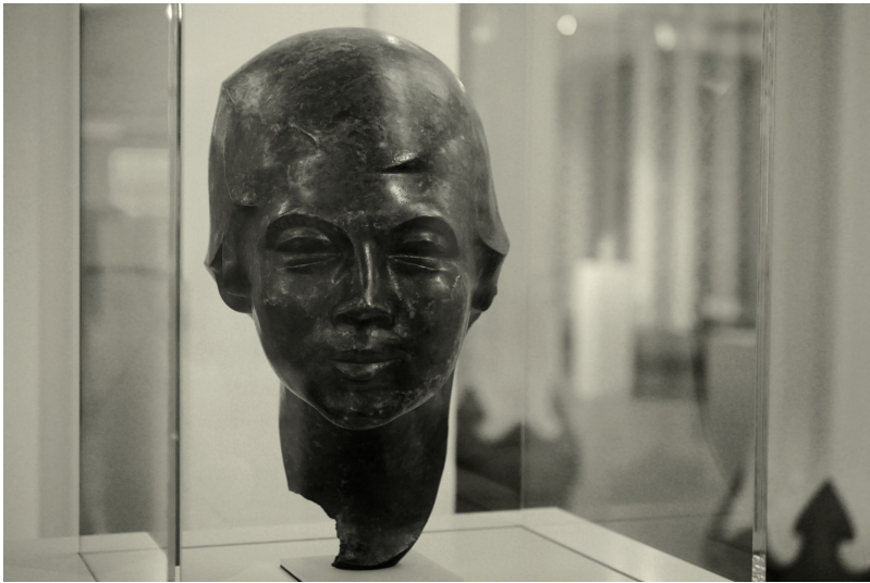
Edwin Scharff. Portrait of the actress Anni Mewes, 1917. Bronze. Karl-Ernst Osthaus Museum, Hagen