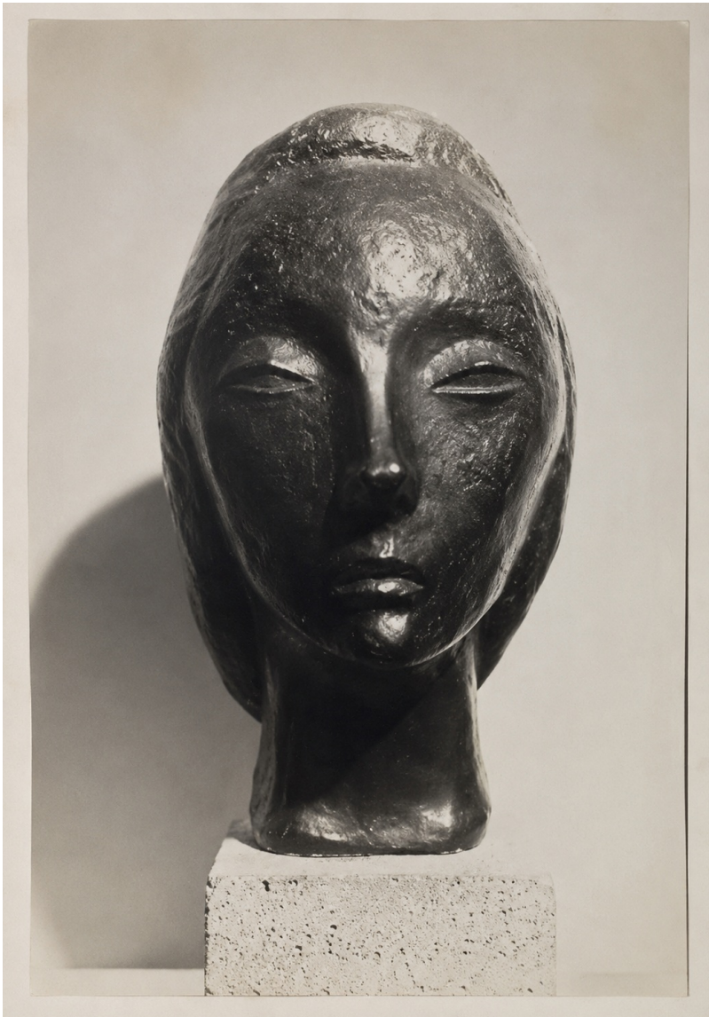
Elisabeth Nobile. Portrait of Lúcia Suané, 1941. Bronze sculpture on granite base, 37 x 15 x 17 cm. São Paulo Museum of Art