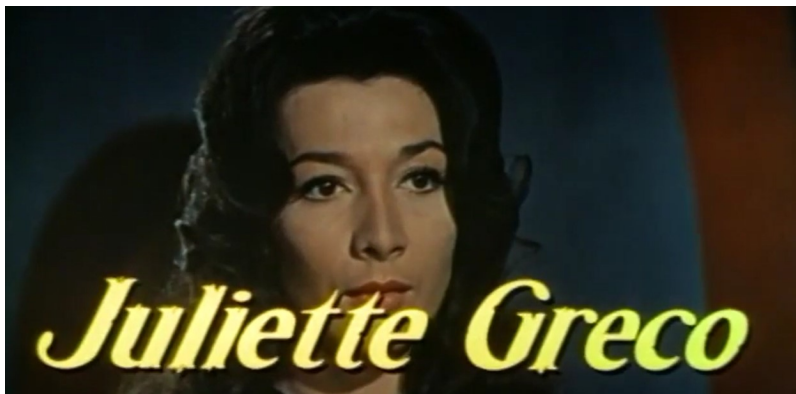
Juliette Greco in John Huston's The Roots of Heaven , Darryl F. Zanuck Productions, United States, 1958. Trailer screenshot

When Les Racines du ciel won the Goncourt, there was no question but that it would appear in English in the USA and the UK in double-quick time. When it did, it was snapped up by Hollywood for a prince's ransom and turned into a technicolor blockbuster, starring Errol Flynn and Juliette Greco. It may not be a terribly good movie, but that's beside the point: Roots of Heaven turned Romain Gary – who was appointed in the midst of this to the coveted post of Consul-General in Los Angeles – into a transatlantic businessman.