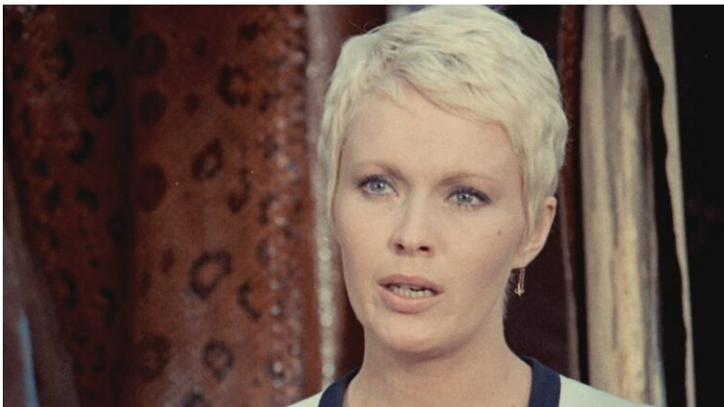
Jean Seberg in Police Magnum (Kill!) , written and directed by Romain Gary, France-Germany-Italy- Spain, Barnabé Production, 1971. Screenshot

Gary never lived in America again, except for brief periods (including the summer of 1968), when Jean was there on location for a film shoot. After a decade of the grand life and a double but no longer hidden identity, he got fed up with being the famous Romain Gary with a celebrity lifestyle and heaps of money, an immeuble at 107, Rue du Bac and a palatial residence in Majorca, not to mention his flat in Geneva and a rural hide-away near Cahors. He wanted to be someone else, so as to be read for what he could write, not for what he had become. He went back to being a nobody, without telling anybody what he was doing.