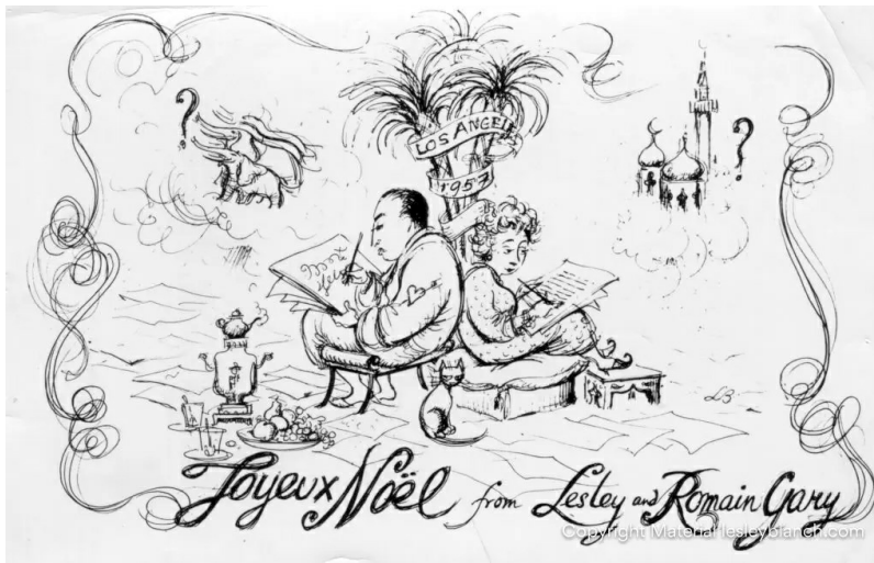
Christmas card by Lesley Blanch, Los Angeles 1957. © Estate of Lesley Blanch