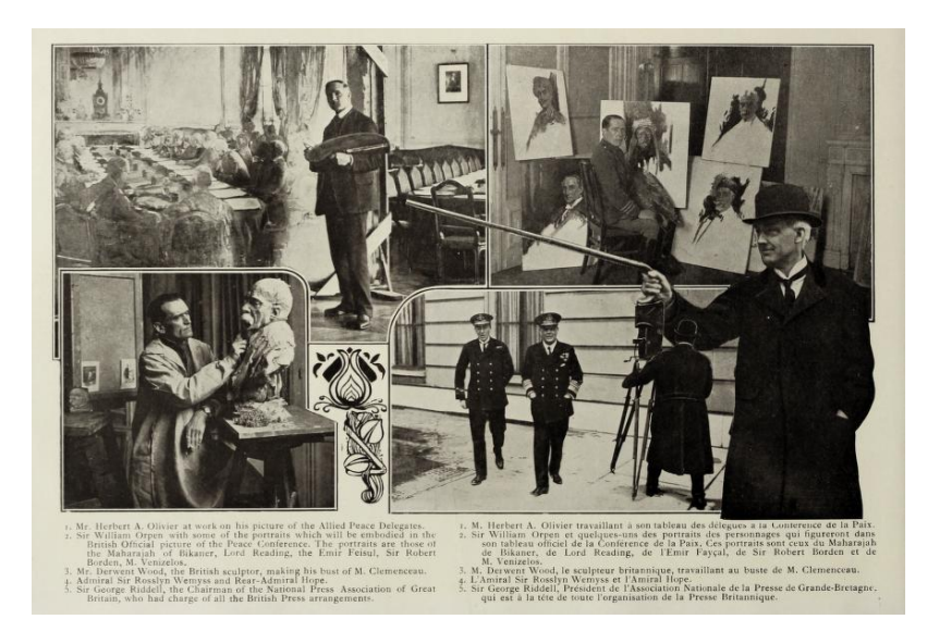
The Peace conference in pictures. Published by the Continental Daily Mail (Paris). Photographs by Victor Console, 1919