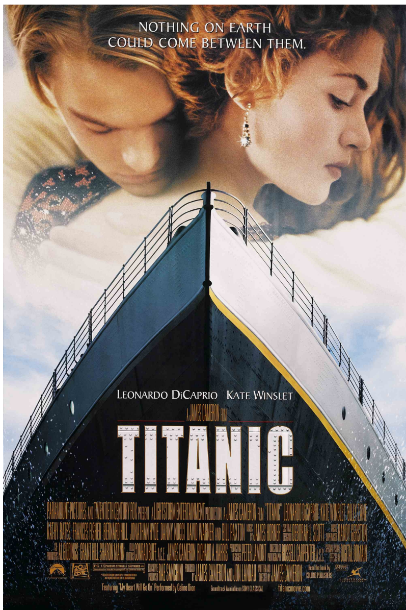
Titanic by James Cameron, 1997