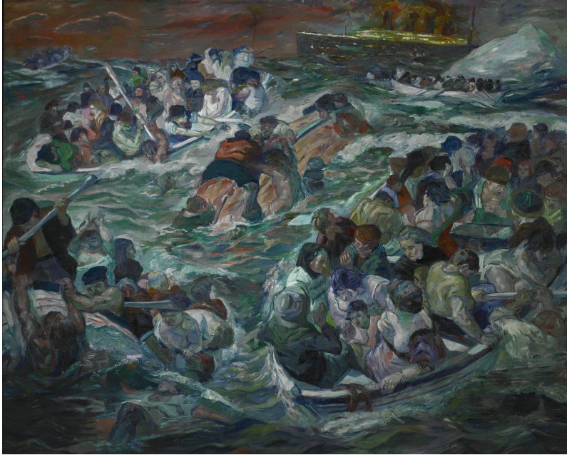
The Sinking of the Titanic by Max Beckmann, 1912-1913

Equally quickly off the ground were some novelisations in countries including Sweden and Finland. As in the UK and US, prominent cultural figures in Continental Europe commented on the disaster, where the discourse often carried undertones of suspicion towards the growing influence of American modernity and popular culture and the threat posed by the new to the old world and its cultural traditions and values, but there was also an acknowledgment of the utopian promise that America offered. Thus, the Titanic found distinct, if sometimes camouflaged echoes in the literary works of Franz Kafka and Thomas Mann (and decades later Hans-Magnus Enzensberger), while being more explicitly addressed in the painting The Sinking of the Titanic (1912) by expressionist artist Max Beckmann.