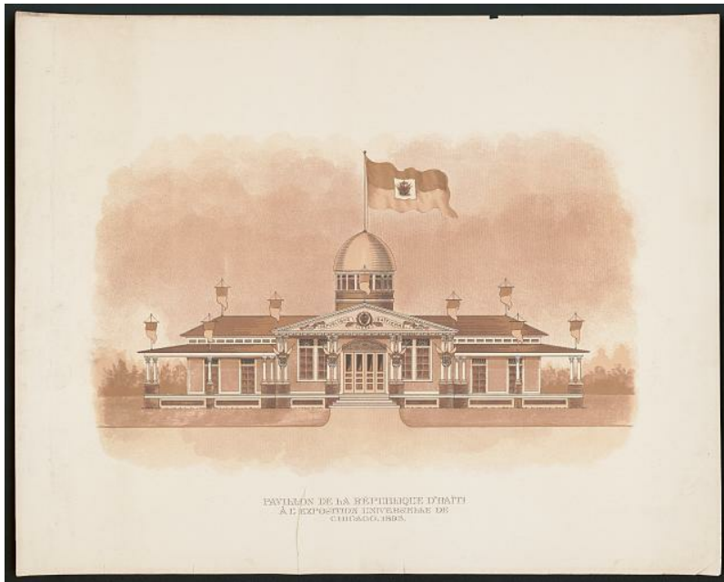
Haiti's pavilion at the World's Columbian Exposition in Chicago, 1893

In 1892, Douglass was appointed as commissioner of Haiti's pavilion at the World's Columbian Exposition in Chicago, Illinois. On January 2, 1893, he gave a speech in which he extolled Haiti as "the only self-made Black Republic in the world" and blamed the racism and imperialism of the United States for the state of the relations between the two countries. "Haiti is black, and we have not yet forgiven Haiti for being black," he claimed . 2