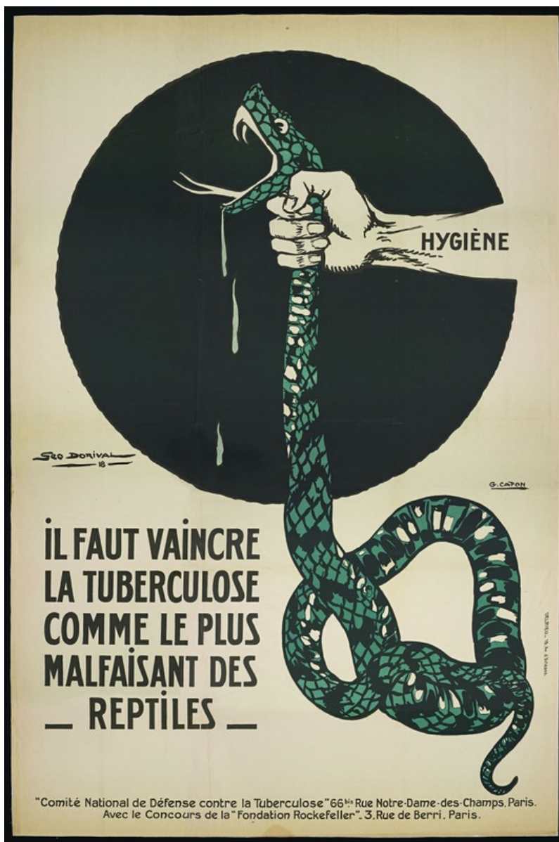
Geo Dorival, G. Capon, « Il faut vaincre la tuberculose comme le plus malfaisant des reptiles », 1918 (Rockefeller Archive Center, Rockefeller Foundation records, photographs, series 500.T). Courtesy of the Rockefeller Archive Center