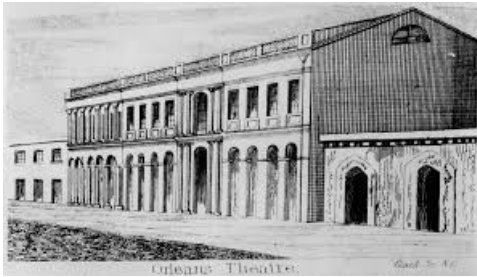
The Orleans Theatre and Ballroom, New Orleans, 1838.

Legend has it that it was again refugees from Saint-Domingue who provided the city of New Orleans on the northern side of the Gulf of Mexico with its first theatre. The first recorded performance of opera in the city - of Grétry's opéra comique Sylvain - took place in May 1796. Early theatres in the city, as with so many in the region, were perpetually plagued by fire, disease, and the corresponding threat of low box office receipts, and many failed to last beyond a few seasons. But from 1819, the Théâtre d'Orléans - the first theatre in north America to have a resident repertoire company - provided the city with regular opera performances, which kept it at the forefront of operatic life in the United States for 40 years. French opera in New Orleans achieved the height of its popularity long after the city became a part of the United States (it ceased to be a French colony in 1803, when Napoleon sold the Louisiana Territory to US president Thomas Jefferson). For audiences in the city, the performance of French works provided a dual imaginative link to both the city's francophone heritage, which was increasingly being subsumed into an anglophone mainstream, and to the image of Paris as a symbol of cosmopolitan modernity.