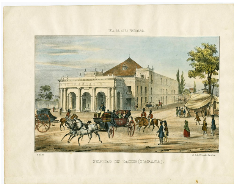
Teatro Tacón (Habana). Frédéric Mialhe, Isla de Cuba pintoresca , 1839