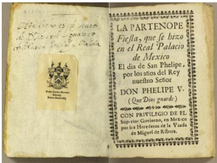
Title page of Zumaya's Libretto for Partenope (1714)

While most works were brought from Europe, there are occasional examples from the colonial period of works composed in the New World. Perhaps the earliest is the one-act opera in Spanish La Púrpura de la rosa , which was premiered in Lima in December 1701. Its composer was Tomás de Torrejón y Velasco, a Spanish man who had come to Lima in the 1660s with the Count of Lemos, one of Casteldosrius's predecessors as viceroy. Although it was likely the first opera composed in the Americas, it preserved close ties to Spain as the imperial centre: Torrejón's music was a setting of an older Spanish libretto, by Pedro Calderón de la Barca, which had first been used for an opera of the same name in Madrid c.1660 by the court composer Juan Hidalgo. The occasion for the premiere of this new version in Lima was the eighteenth birthday of King Philip V of Spain. It was not long after, however, that the first opera to be written by a composer born in the Americas - Manuel de Zumaya's Partenope - received its premiere at the viceroy's palace in Mexico City in May 1711. Zumaya (c1678-1755) was born in Mexico, and he served as director of music at the cathedral in Mexico City and later in Oaxaca. Unlike La Púrpura de la rosa , which featured mainly strophic songs in Spanish fashion, Zumaya's Partenope was a three-act work, Neapolitan in style, which might even have been performed in Italian.