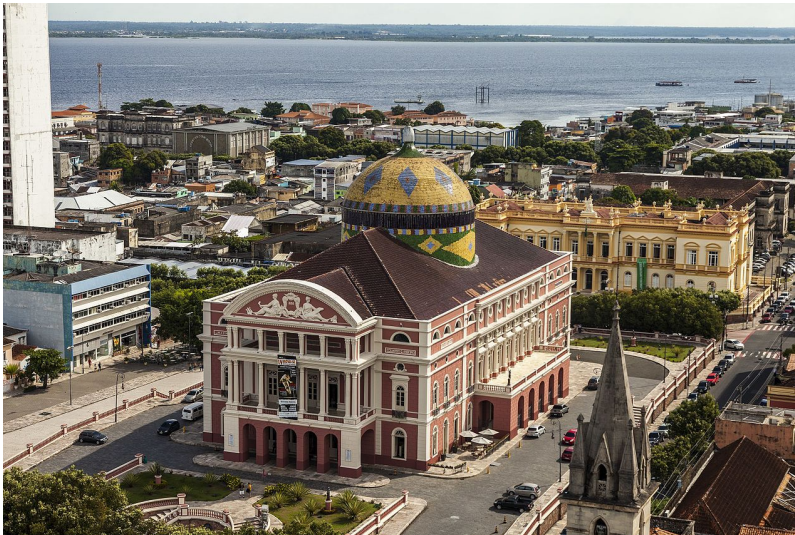
Aerial View of Teatro Amazonas, Manaus. Author: José Zamith

Infrastructural developments not only facilitated performances in new places, but also helped to create different images of and roles for opera. Most prominent of these developments was the building of grand new theatres, which served to produce operas (as well, in many cases, as a great variety of other entertainments). The building of a theatre was sometimes used to signal colonial power. In 1830s Havana, General Miguel Tacón, the newly appointed governor general of Cuba (which was, in the 1830s, the only remaining Spanish colony), ordered the building of the Teatro Tacón, a grand theatre with over 2000 seats and standing room for several hundred further spectators, which was inaugurated on 15 April 1838. The theatre was known for its luxury and for the fact that it played host to some of the largest opera troupes to be found outside Europe for much of the nineteenth century. Its acoustic was deemed to be so good that the present-day building housing the Gran Teatro de La Habana Alicia Alonso was built around the outside of the Tacón auditorium.